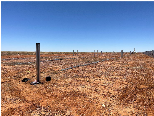
Fig 1- Installing the posts

Figures 1-4 show what has been installed.