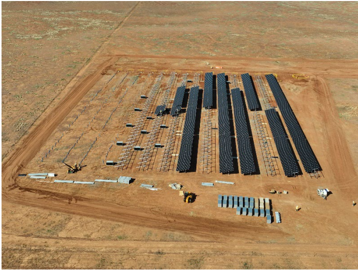
Fig 4- Completed solar panels installation

Local benefits for the community will see a local fencing contractor commence works once tender process has been completed.