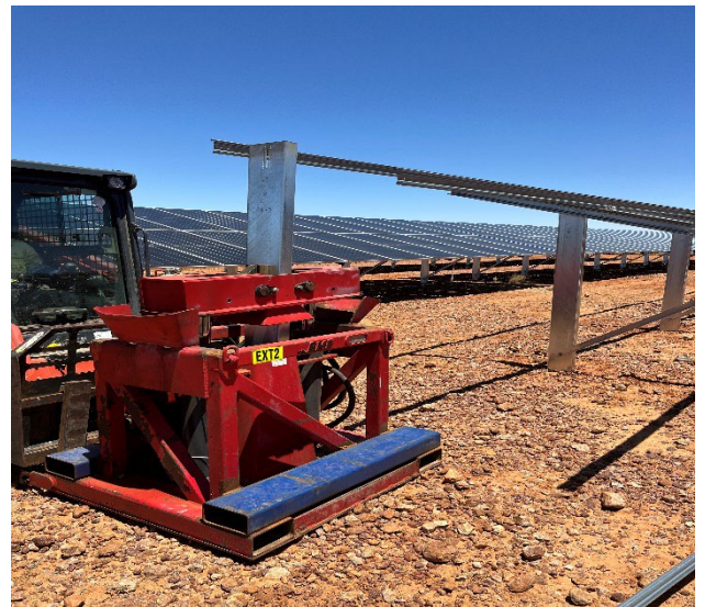
Fig 2- Quality assurance: Pile extraction to ensure alignment of posts