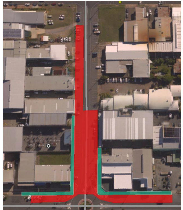
Fig 7 – Footpath and roadway reinstatement sites.

We will once again complete these works in stages.