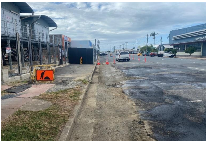
Fig 5 & 6 – Road surfaces and footpaths disrupted during project works to install new underground cables – will now be reinstated.

The final stage of works on the project will involve the reinstatement of all the footpaths and roadways that were disrupted during our earlier works on the project.