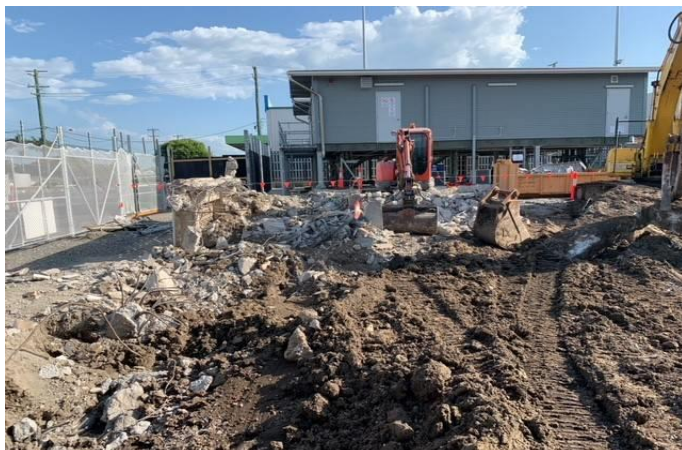
Fig 2 – Excavators demolish the old Tennyson Street substation.

Demolition of the Tennyson Street substation building, and redundant electrical equipment has paved the way for the final stage of the Mackay City substation works. We will shortly start construction of an authorised vehicle access and carpark on the old site for substation workers who will maintain the new Mackay City substation.