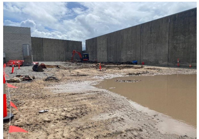
Fig 3 – Old Tennyson Street substation demolished in preparation for the construction of the vehicle access and carpark.

The recent wet weather has delayed the construction of the vehicle access and carpark – see Figure 3 - but our contractors are set to complete the vehicle access works in the substation as soon possible once the site dries out.