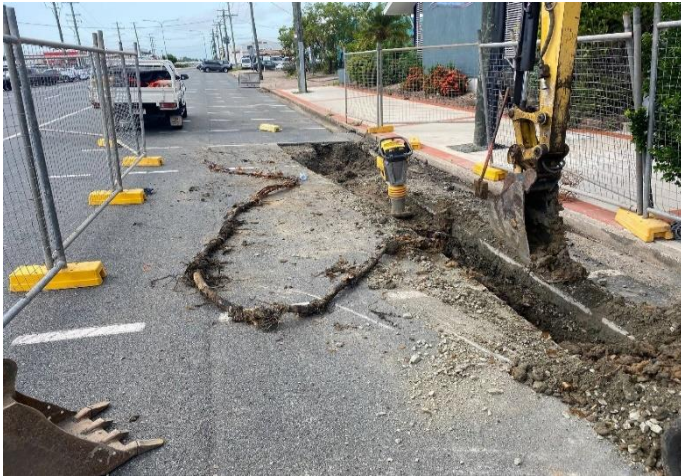
Fig 4 – Redundant direct-buried underground cables being removed.