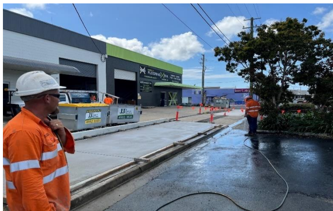
Fig 1 – Freshly poured concrete slab in Gordon Street

Civil works to reinstate footpaths in Tennyson and Gordon Streets are progressing well, with the concreting having been recently completed in Gordon Street in front of Watson's Fencing, Inner Labyrinth, and Flooring Xtra (see Figure 1).