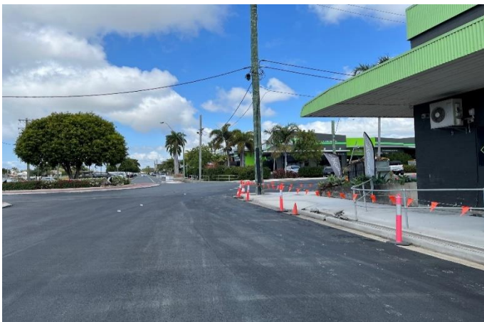
Fig 5 – New bitumen roadway in Tennyson and Gordon Streets

Night works to install the new bitumen in Tennyson and Gordon Streets was completed in September (see Figure 5).