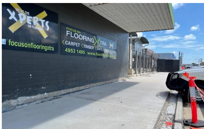
Fig 2 – Completed concrete works on footpath in Tennyson Street. Many areas along Tennyson Street have now been concreted (see Figure 2) with other areas, such as the footpath adjacent to the Aboriginal and Torres Strait

Islander Community Health Service, at the top of Tennyson Street, ready to pour (see Figure 3).