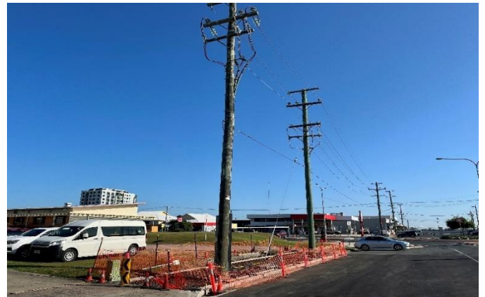
Fig 3 – Concrete formwork ready for pouring new footpath outside

Islander Community Health Service, at the top of Tennyson Street, ready to pour (see Figure 3).