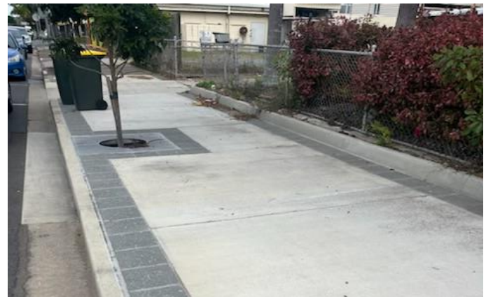
Fig 4 – Example of how the footpaths will look like once reinstated.

Some business owners have asked why we have started work on a new section before the current section is complete. As mentioned in our previous update to ensure that the new footpaths are built to a standard consistent with other areas around the city, the Mackay Regional Council requires the footpaths to be reinstated to their new construction standard, which includes a grey feature paver (see Figure 4).