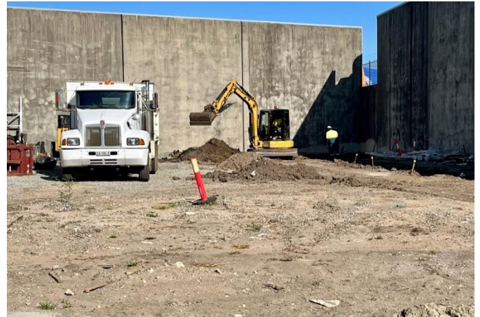
Fig 6 – Civil work recommences at the Mackay City Substation.

While the substation has been energised and is already powering local businesses and residents in the CBD and eastern suburbs, our contractors still have some civil work to complete to establish the vehicle access and parking area for the crews who maintain the substation.