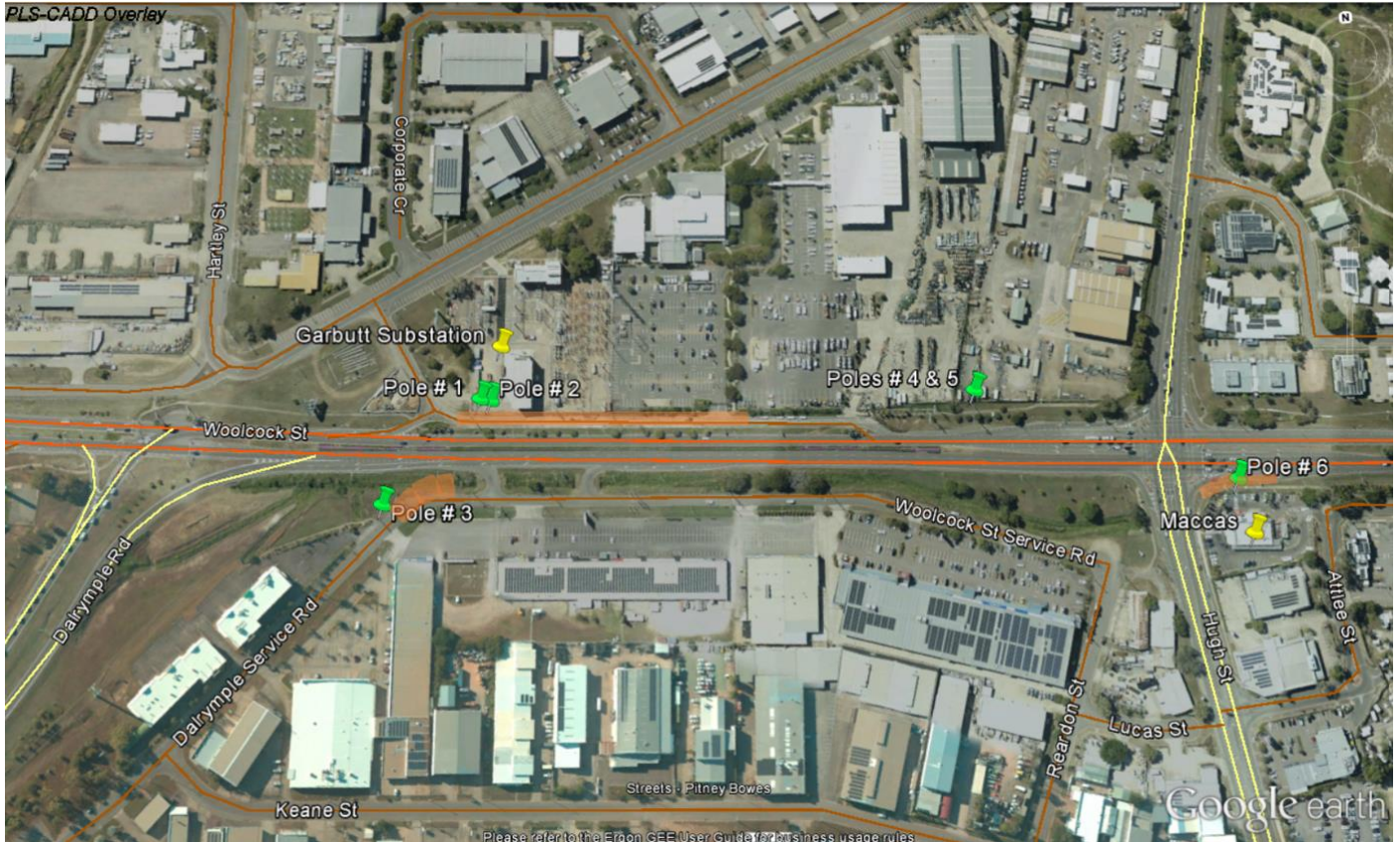
Figure 1 – locations of new poles and areas with traffic control arrangements around site (shaded in orange).