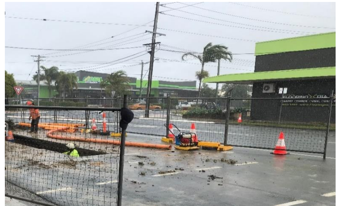
Fig 2 – Welcome rain for the Mackay region in early July, delayed some excavation works.

Despite a few factors, like some welcome rain for the region earlier in July and unearthing some undocumented underground assets belonging to other utilities, Jai-Cor continue to progress the complex civil works.