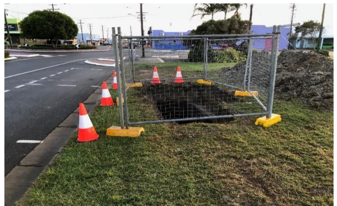
Fig 7 – Trench entrance in Tennyson Street after under boring below the roundabout on Tennyson and Gordon Streets.

Where possible, under boring was utilised to limit disruption to the road and surrounding infrastructure. The section under the Gordon Street roundabout is an example.