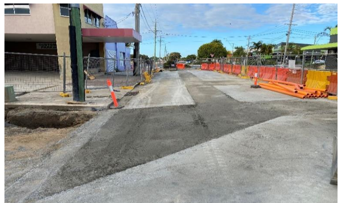
Fig 8 – Temporary reinstatement of road after trenching works.

Conduits have been installed - ready for Ergon Energy Network to install the electrical cables later in the program of work - and the trenches temporarily backfilled. This is a temporary finish, with full reinstatement of the road and footpaths in the work area scheduled for later in the project when all the cable installation works are complete.