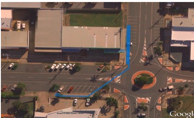
Fig 10 – Stage 4 – planned Tennyson and Gordon St civil work.

As a reminder, Jai-Cor will trench along Tennyson Street to the corner of Gordon Street in the south. They will then bore under Gordon Street, from the corner of the roundabout next to Flooring Xtra, across to the other side of the road in front of Ideal Electrical. Trenching will recommence along the footpath in front of Ideal Electrical and conduits will be laid.