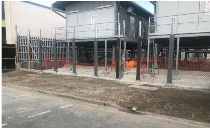
Fig 1 – Installation of substation security fencing

Until recently, work on our Mackay City Substation in Tennyson Street has largely been conducted behind the substation fence, with little disruption to customers and the local community. Since our last update, our contractor Corbett's constructed the internal security fencing at the substation.