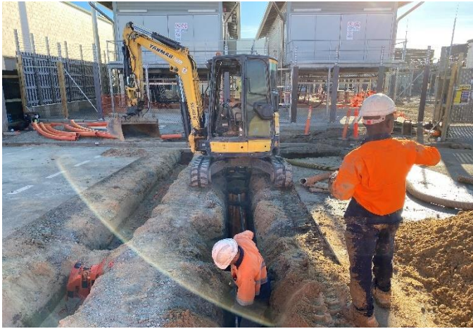
Fig 3 – Jai-Cor crews excavating trenches for conduit that will house the high voltage cables out of Mackay City Substation.

First the road and footpath surfaces were cut with a concrete saw and then a combination of mechanical excavation - using a mini-excavator and a vacuum truck - as well as good old-fashioned shovel work, was adopted to provide access to lay the new conduits for the electrical cables which Ergon Energy Network will install in the coming months.