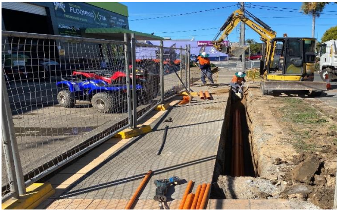
Fig 9 – Gordon Street works in progress.

This phase of work involved excavation along the north-west section of Gordon street in front of Jeff's Bikes and Focus on Flooring Xtra. These works included the installation of conduits for electrical cables along Gordon Street. In a future stage of works, Ergon will run the high voltage electrical cables which will connect to the electricity network back towards Shakespeare Street.