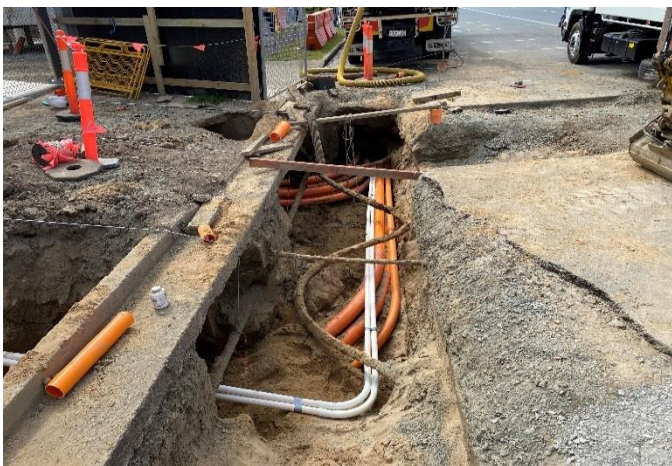
Fig 4 – Conduits for the high voltage cables out of Mackay City Substation are installed.

First the road and footpath surfaces were cut with a concrete saw and then a combination of mechanical excavation - using a mini-excavator and a vacuum truck - as well as good old-fashioned shovel work, was adopted to provide access to lay the new conduits for the electrical cables which Ergon Energy Network will install in the coming months.