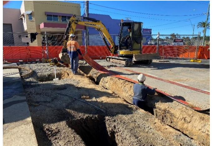
Fig 6 – Electrical conduits for cables are installed in front of the substation.

Where possible, under boring was utilised to limit disruption to the road and surrounding infrastructure. The section under the Gordon Street roundabout is an example.