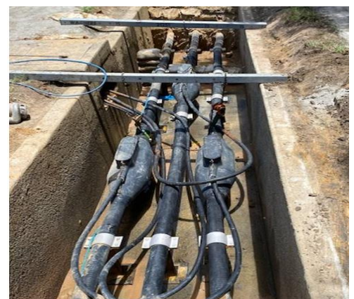
Figure 1 – Example of an underground cable joint bay

These works along Dalrymple Road are scheduled to commence on Monday, 12 th June and take approximately 4 weeks to complete, with a scheduled completion date of around Friday, 7 th July 2023.