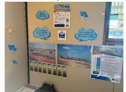
Fig 2 – Windorah Solar Farm & Battery Project display at the Info Centre.

The ladies have created this awesome display - see Figure 2 - that includes our artist impressions of what the solar farm and battery facility will look like, information about the project stages and timeline, and a handful of free LED torches. We will continue to send project