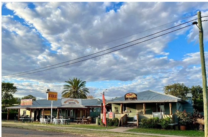
Fig 3 – Thanks to the team at Windorah’s Western Star Hotel for your hospitality during our recent visit.