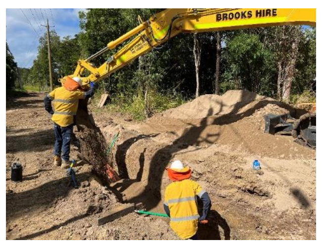
Fig 1 – Contractors installing lengths of conduit.

• Traffic management, with traffic reduced to a single lane under 'stop-go' traffic control around the work site. Refer image over page.